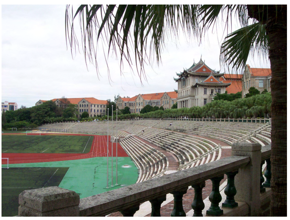
The Xiamen University Campus